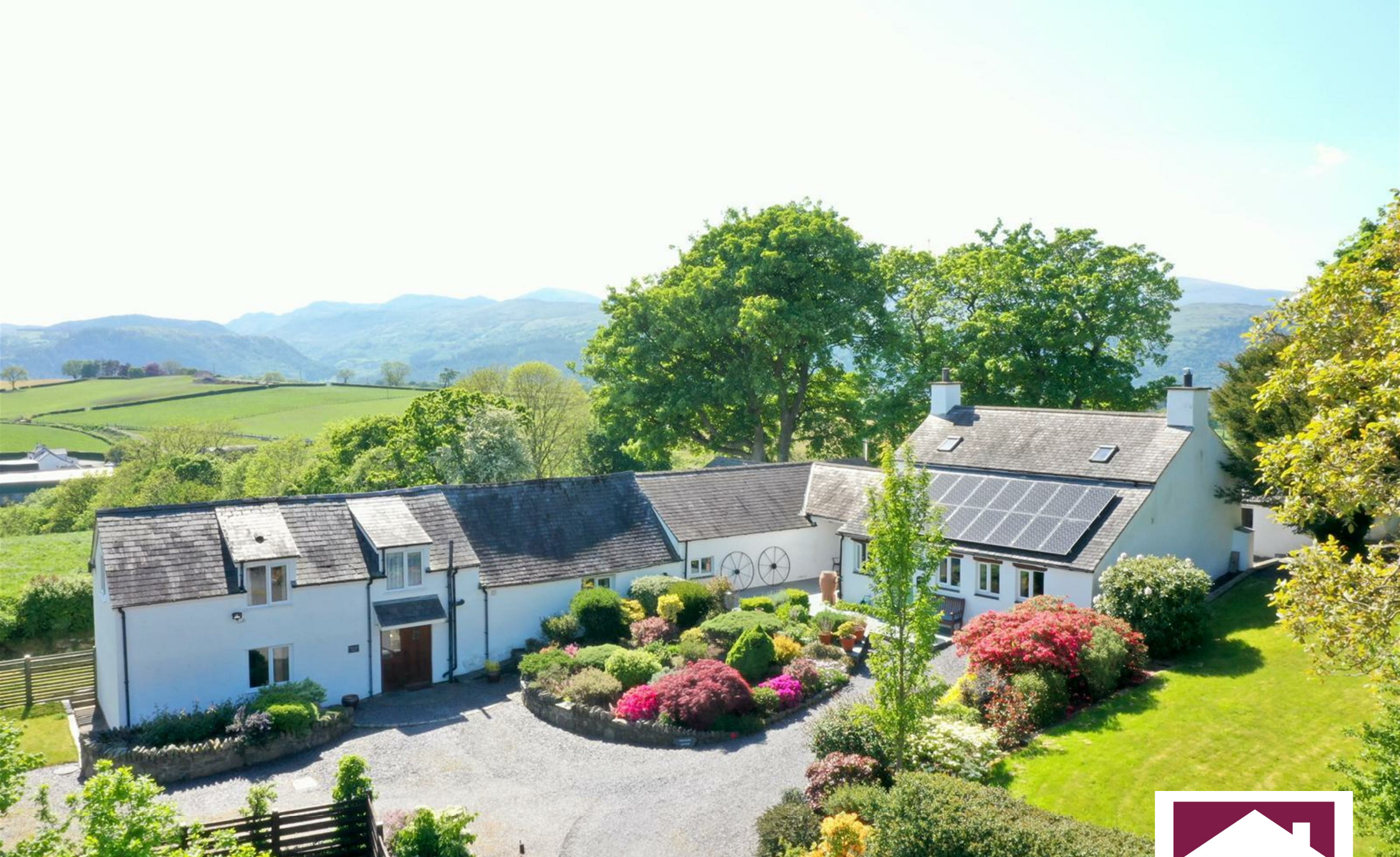
Pencraig Arthur Llanddoged Conwy Valley LL26 0DZ